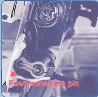
Feed eccentric pin