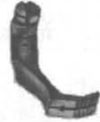
INSIDE FOOT #91-040474-93X40 (#40474-4)