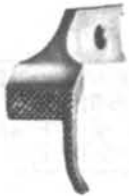
OUTSIDE WALKING FOOT #91-044227-04 (#44227)