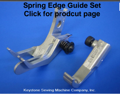
Spring Edge Guide Set Click for product page

Kindly Reference full part number when referring to parts