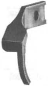
OUTSIDE WALKING FEET

#91-040475-04X50 (#40475-5) #91-040475-04X60 (#40475-6) #91-040475-04X80 (#40475-8) #91-049558-04C/D (#49558C-D)