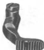
INSIDE WALKING FOOT #91-049085-93C (#49085-C)